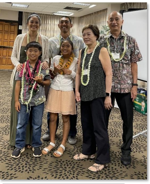
↑ Character Counts! Family