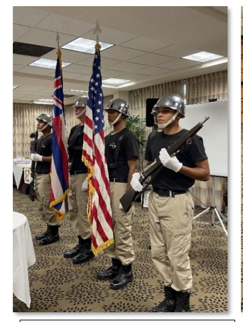
Opening ceremony – Youth Challenge Honor Guard ↑