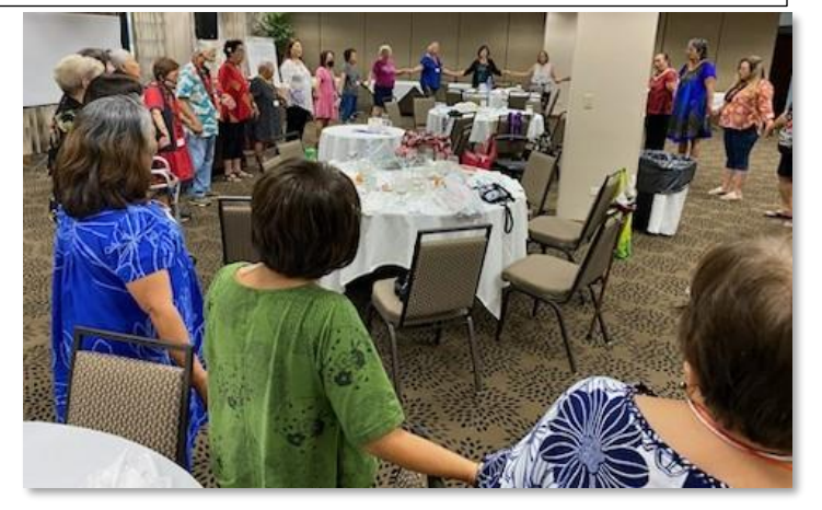
Closing Ceremony – Hawaii Aloha ↑