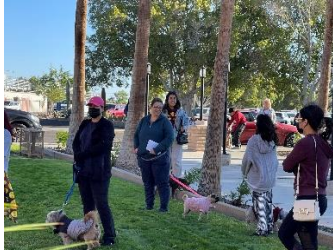
Waiting in line